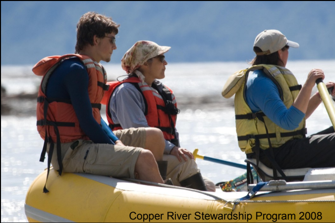
Copper River Stewardship Program 2008