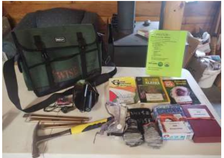
The Geology Pack includes tools, safety goggles, books, games, and a small collection of rock samples.

As soon as we started dreaming up topics and making wish lists of pack contents, it was clear this project was going to need some funding! Copper Valley Electric Association Community Foundation, which has supported In-Class Science right from the