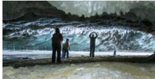
Exploring Castner Glacier Ice Cave with homeschool families.

Copper River School District Prince William Sound College University of Alaska Fairbanks Valdez City Schools Campbell Creek Science Center