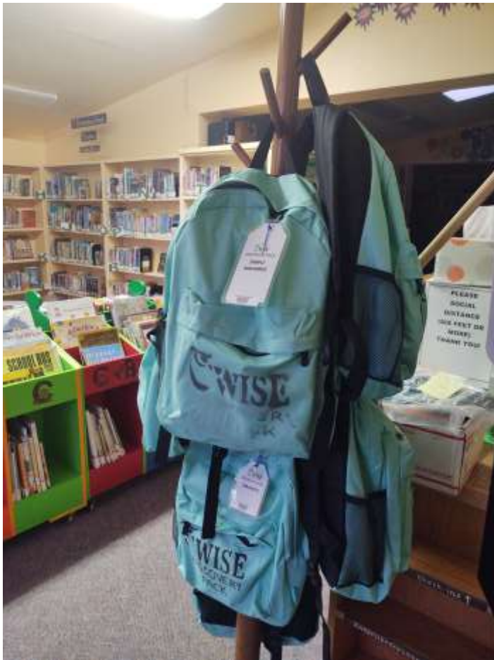
The brightly colored backpacks can be found in the childrens sections of the Kenny Lake, Glennallen, and Valdez libraries.

start, designated funds for the packs. Additionally, Kenny Lake Public Library had a grant from Alyeska Pipeline Service Company for their Book Camp which they were unable to use. Alyeska approved the transfer of the funding to the Discovery Pack project. This added up to enough funding to purchase plenty of books and materials to use for each topic. The birdwatching packs have kid-friendly field guides and binoculars, and the geology pack includes a fun set of hammers and chisels to investigate interesting rocks.