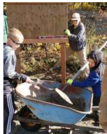
Copper Nuggets 4-H Club members mix cement for the Kids Don’t Float kiosk at Squirrel Creek State Campground.

Changing Seasons for second and third graders was postponed because of early snowstorms, but went ahead the next week. A small but dedicated team made it happen!