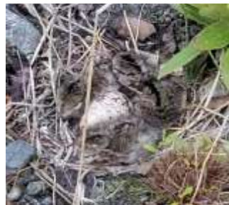
We were surprised to find this well camouflaged shorebird nest in the midst of our camp.

As with all WISE programs, Leave No Trace was a common theme we discussed often on this program. The students learned hand gestures to help them remember the 7 principles of Leave No Trace and used the principles as a lens to help guide decisions in the planning stages and on the trail.