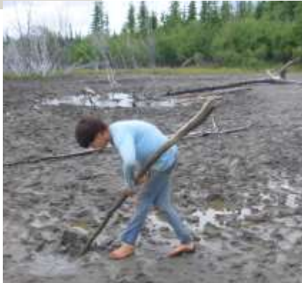
A visit to Tolsona 1 includes barefoot fun, and testing the depth of the mud with sticks.

Leave No Trace also teaches the concept of cumulative impact. One person’s disturbance may be minimal, but multiplied by every visitor it can become catastrophic. In Alaska we are lucky to have many, many places where human visitation is so infrequent that our impact is barely noticable. But like the Tolsona 1 Mud Volcano, some places are definitely at risk of being loved to death. Four wheelers turn trails into bottomless mud pits, and scores of enthusiastic anglers trample the riparian vegetation that shelters the next generation of fish. Growing an awareness of the problem, and teaching real skills to visit the wilderness without leaving a trace is a never ending project.