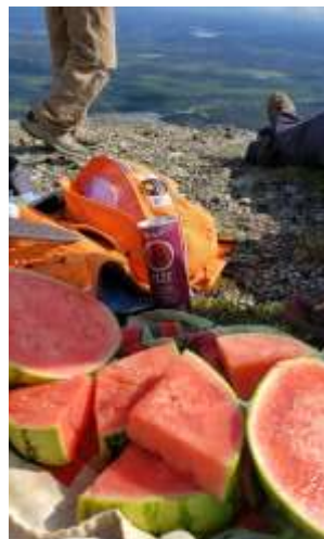
Watermelon at the top of Willow Mountain has become a WISE end of summer tradition.

WISE also assists with partner programs throughout the year. For details see the 2021 Annual Report at www.wise-edu.org .