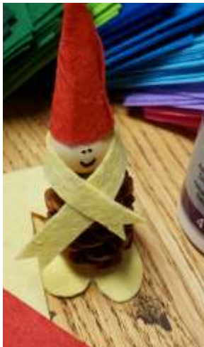
This little guy stopped by the office to help pack boxes for Winter Fun Day!

Nic’anilen na’ , our property at Lower Tonsina, is getting a management plan! We are working with the National Park Service Rivers, Trails, and Conservation Assistance Program on an intensive planning and visioning process. We were excited to host our first program on site, an Aquatic Ecology Day.