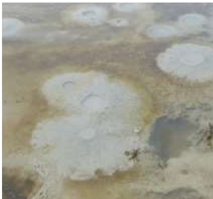
At Tolsona 2, undisturbed pools reveal subtle patterns.