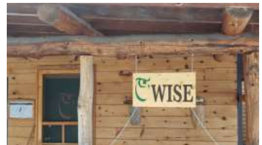
The welcoming porch of the WISE house shelters this handmade sign, a rock collection, and space to gather gear for programs.

The house is home-built, with more than a few quirks, but it suits WISE perfectly. We enjoy a large, wood-beamed office space with cozy woodstove and plenty of storage. The connected house and tiny cabin in the woods serve as staff housing or rental property which generates enough income to pay all the utilities.