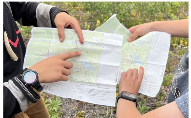
Taking a moment to check the map on the ascent of Willow Mountain.

"I learned that people upriver and downriver are both greatly affected by the quality of the waters, and that everyone should take better care of the water."